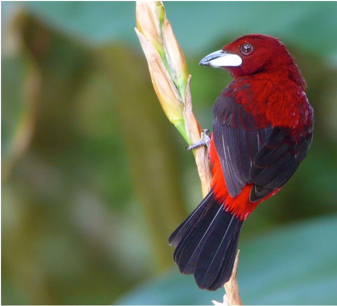
Crimson-backed Tanager

Palm, and Dusky-faced tanagers; Red-crowned Ant-Tanager; Bananaquit; Red-legged Honeycreeper; Orange-billed Sparrow; Buff-throated Saltator; Thick-billed Euphonia; and Chestnut-headed Oropendola (a colony of which sometimes nests on the hillside above).