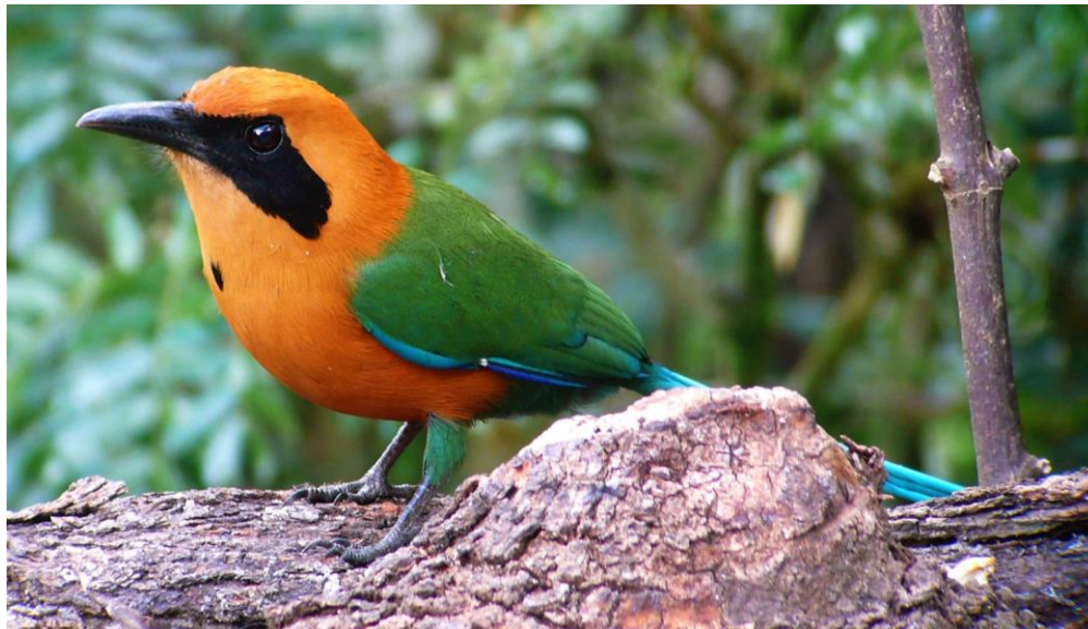
Rufous Motmot

After a tasty lunch, we will pay close attention to the feeders and explore the expansive grounds. Among the many species that visit the garden and feeders are Gray-cowled Wood-Rail; Rufous Motmot; Collared Aracari; Red-crowned Woodpecker; Clay-colored Thrush; Crimson-backed, Flame-rumped, Blue-gray,