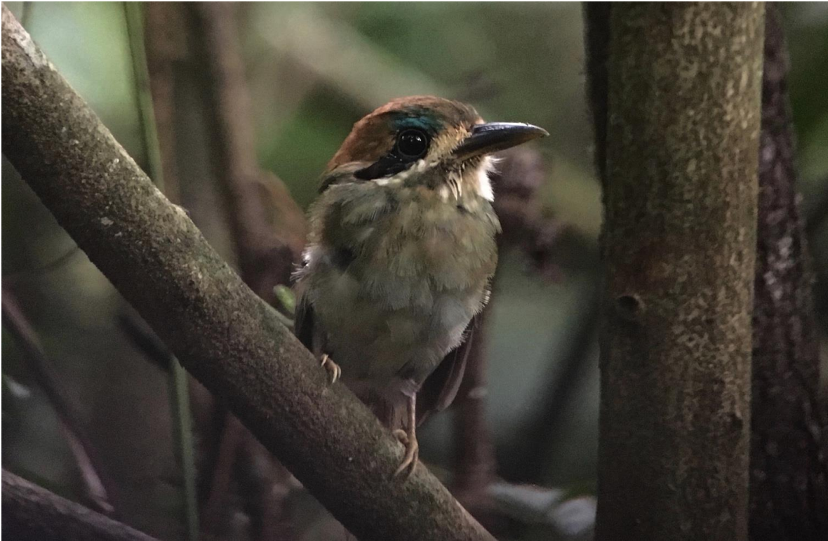
Tody Motmot © Barry Zimmer