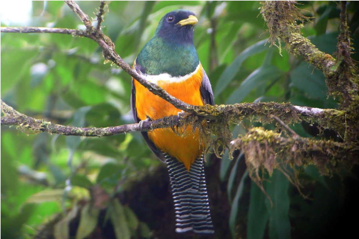
Orange-bellied Trogon

Straddling the Continental Divide, the foothills of Panama harbor a unique avifauna that includes both lowland and highland species, as well as birds of both the Pacific and Caribbean slopes. Our tour, designed to pick up where traditional Canal Zone tours leave off, offers some of Central America's most exciting birding, set amidst beautiful middle-elevation forest and in a refreshingly moderate climate.