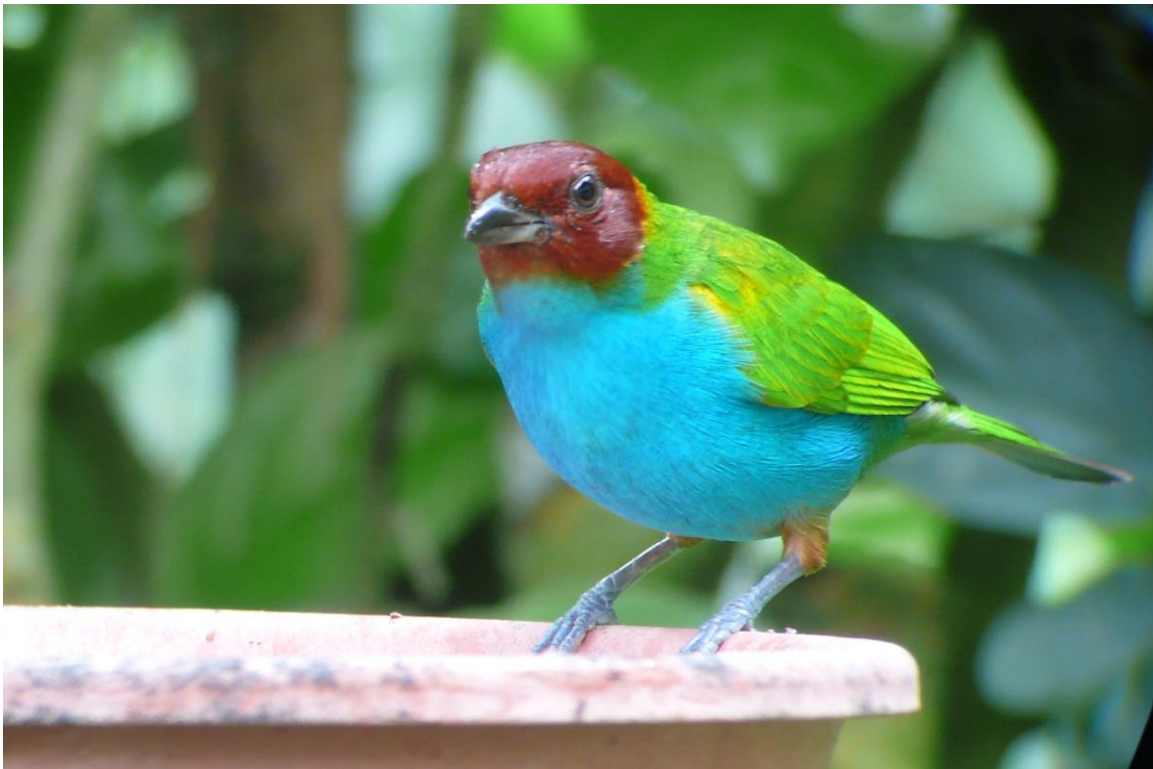
Bay-headed Tanager

This area is home to some fantastic foothill birds not found in the forests below or the Canal area. Among these, tanagers are the dominant group with potential for gems like Emerald (scarce), Bay-headed, Silver-throated, Golden-hooded, and Tawny-crested tanagers; Tawny-capped Euphonia; and Scarlet-thighed Dacnis.